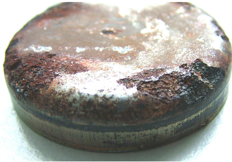
A 3 Sealing cover, corroded