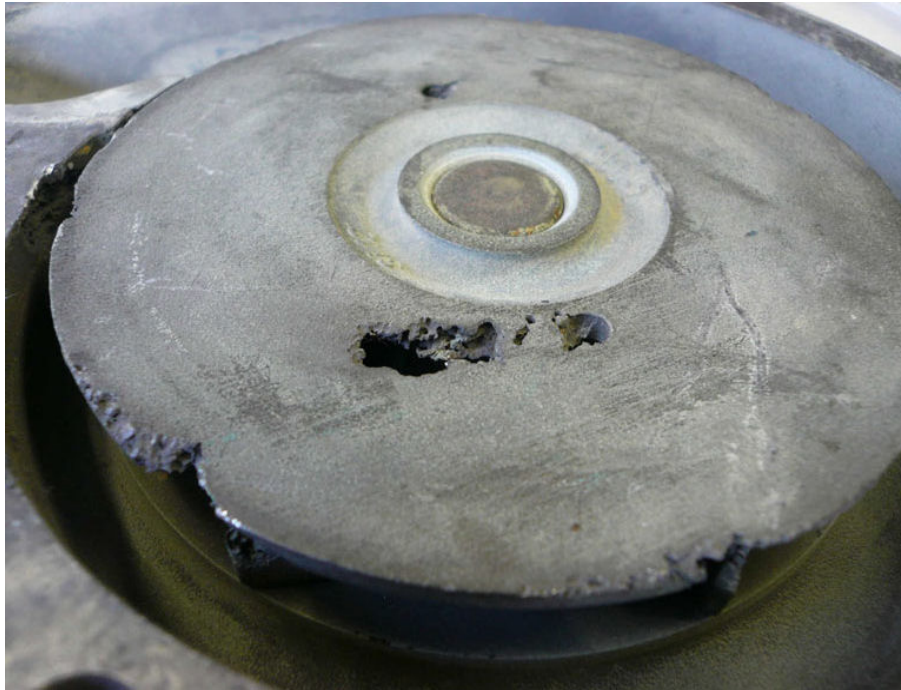
A 7 Flywheel of the coolant pump, cavitated