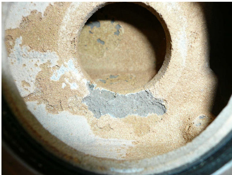
A 4 Aluminium thermostat cover, corroded