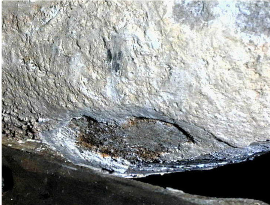
A 5 Limescale deposits on a cylinder liner