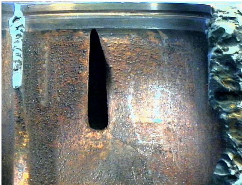
A 2 Cracked cylinder liner